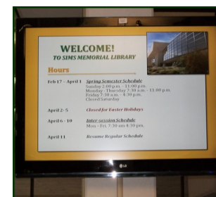
The lobby sign provides hours, events, and other information