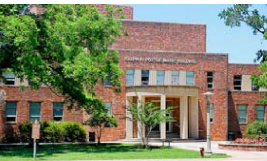
The Ralph R. Pottle Music Building, originally built in 1939, was one of several on the Southeastern campus with archaic controls that was upgraded with the Alerton system to provide more accurate and comfortable temperatures for students, faculty and visitors.

The university's physical plant staff also received comprehensive factory training so that they know everything they needed to know about operating, maintaining and programming their control system was available to them. Now Southeastern physical plant technicians can do their own commissioning on an annual basis.