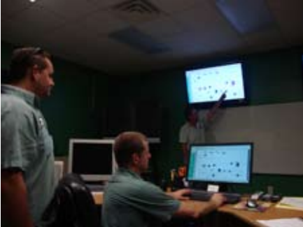
Establishing an energy management department and updating its controls generated substantial savings of more than $675,000 in the first year.

turned to Systems Integration, the local Alerton dealer, to install a series of system upgrades to also enhance control and savings.