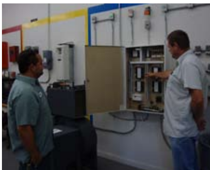
DDC-based controllers enable SLU staff to precisely monitor and control energy consumption in more than 30 buildings across the 365-acre campus.

For years the Southeastern Louisiana University (Southeastern) physical plant staff struggled to control temperatures and energy consumption by the heating, ventilating and air conditioning (HVAC) equipment on campus. The control system was a hodge-podge of systems; many buildings on campus were completely pneumatic while others were a mix of pneumatics and energy management system (EMS) start/stop.