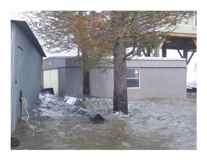
Figure 2: Day of Hurricane Rita At noon on September 24, 2005, Rob Moreau took this picture from a pirogue that was initially launched at the rail road tracks at Galva Canal in Manchac. Water was over three feet deep and with white caps in the Galva Canal parking lot. The brown Turtle Cove storage shed pictured here floated 100 ft across the parking lot and came to rest at the base of the stairs of the new Classroom facility.

which the station flooded about four feet deep. One month later on September 24<sup>th</sup> Hurricane Rita flooded the station a foot deeper. Though Turtle Cove, which was built in 1908 on mud sills (and not on pilings) somehow remained intact through both of these events, it did incur significant damage. The front porch was blown away, the roof was damaged, and most importantly the superstructure itself shifted and sank, especially on its west wing. In addition, 95% of the boardwalks and wharves and most areas of the bulkheads at the main house and the Caretaker's residence were either completely destroyed or severely damaged.