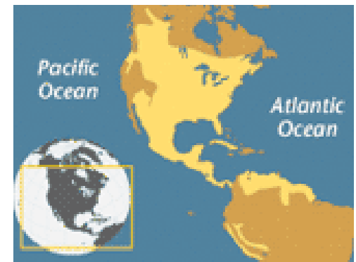
Deer habitat in yellow