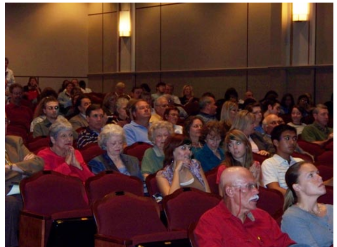
Premier Night Crowd Awaits Film