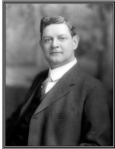
Pictured: Jared Young Sanders, Sr.