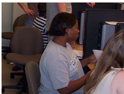
Students at work in the SSSRC

The SSSRC has also been involved with the Hammond Weed and Seed Initiative, a program intended to help weed out crime and replace negative factors with revitalization efforts.