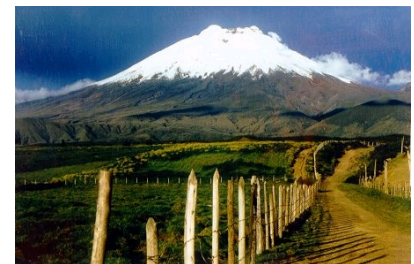
Cotopaxi volcano, Ecuador