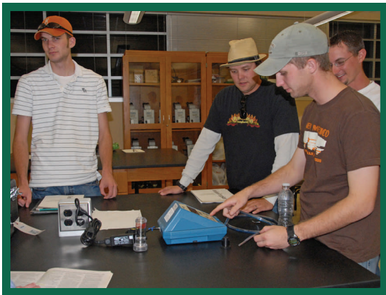
Occupational Safety, Health, and Environment Students

The OSH&E Bachelor degree program is undergoing a preparation for the Accreditation Board for Engineering and Technology (ABET) accreditation. The OSH&E two-year Associate of Applied Science degree program has been accepted for the National Association of Industrial Technology (NAIT) accreditation. Because of these, students have access to both the high-quality courses and the most technologically advanced equipment in the state.