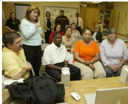
At Hammond Westside Upper School, Southeastern Louisiana University Master of Arts in Teaching graduate students participate in a web cast with students at the Massachusetts Institute of Technology. The Southeastern and MIT students will work together to develop curriculum for laptop computers donated to Westside Upper by the Virtue Foundation.

work with Westside students on the laptops. The Southeastern students collaborated with students at MIT via an Internet web cast on March 7, to brainstorm ideas to use with the elementary students and will continue to work with MIT students to develop the full curriculum. The program has been featured in local media such as The Advocate and The Daily Star. The Virtue Foundation has also issued a press release to national media outlets.